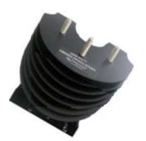
Please Note: Registered German Utility Model DBGM protected PCT Patent Application